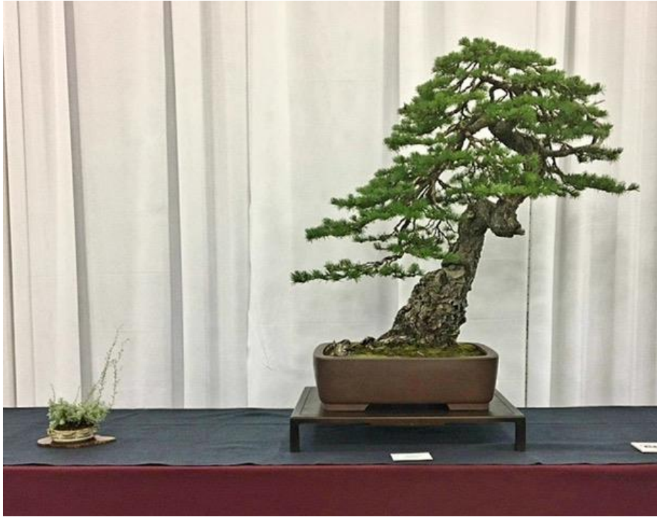
DOUGLAS FIR - TODD SCHLAFER